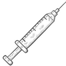
Injection (or) syringe